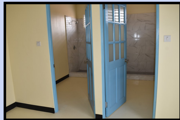
Restroom for COVID-19 patients