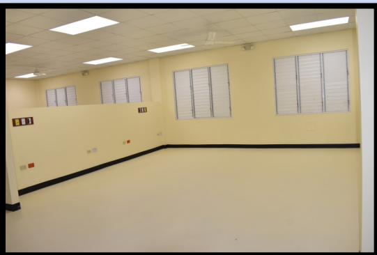
Bed space cubicle