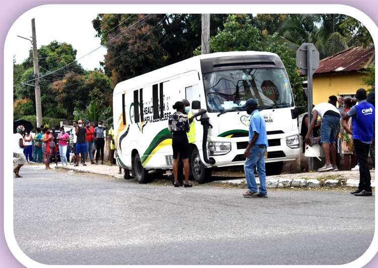
COVID-19 testing site on Red Hills Road (85 Red Hills Rd)

The testing was done as part of their continued Health Promotion Tour weekly activities to sensitize residents about COVID-19.